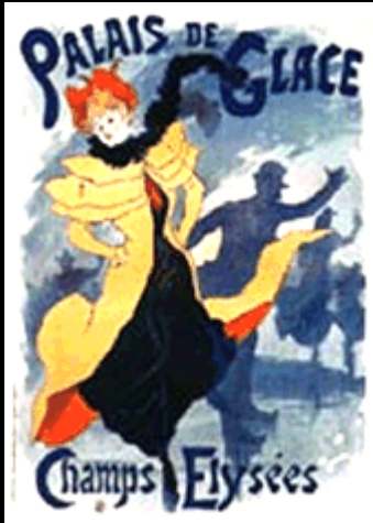
Palais des glaces -Chéret