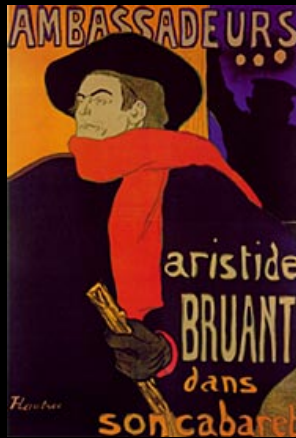
Bruant de Toulouse- Lautrec