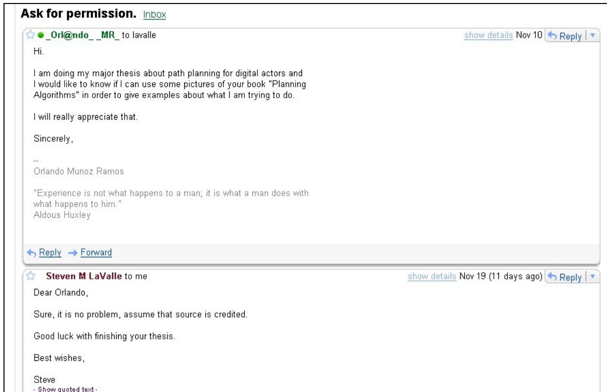
Figura D1: Autorización para incluir imágenes del libro Planning Algorithms.