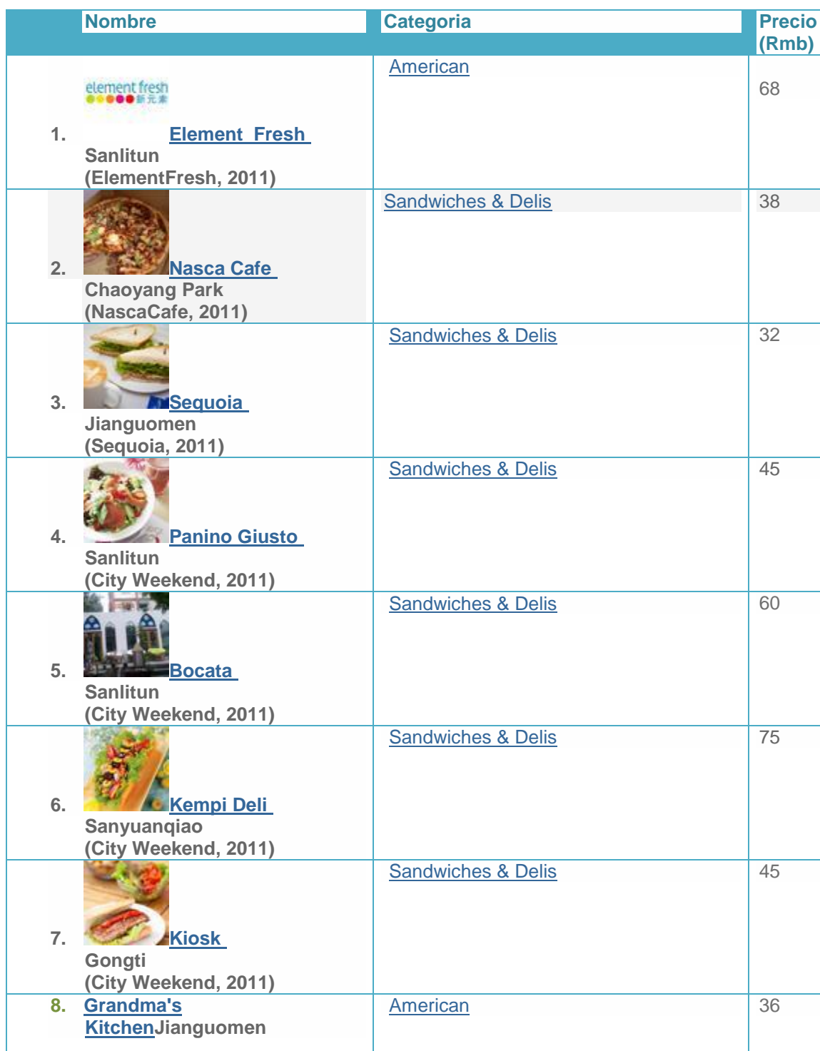
Tabla 2 “Top 10 competencia en costos”